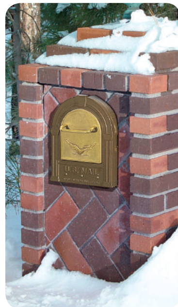
#4815E in a brick column displayed