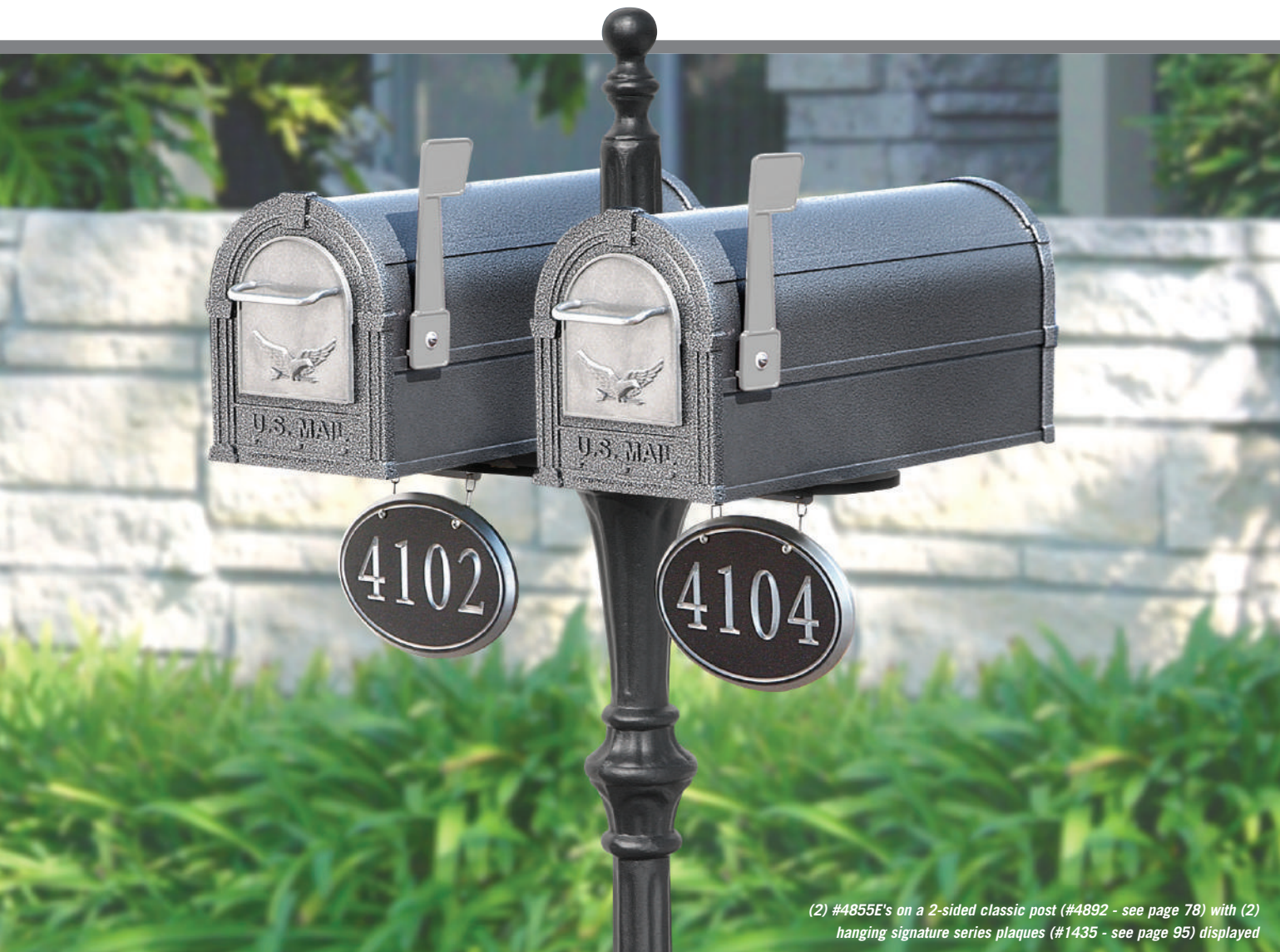
(2) #4815E's on a 2-sided classic post (#4892 - see page 78) with (2) hanging signature series plaques (#1435 - see page 95) displayed