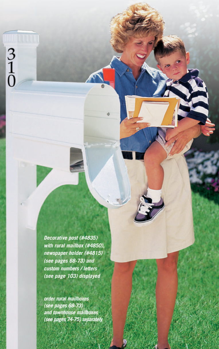
Decorative post (#4835) with rural mailbox (#4850), newspaper holder (#4815) (see pages 68-73) and custom numbers / letters (see page 103) displayed

Volume Discount Pricing Available On-Line!