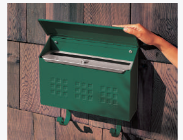
#4615 with privacy plate (included) and optional security kit (#4611) displayed