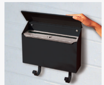
#4610 with optional security kit (#4611) displayed