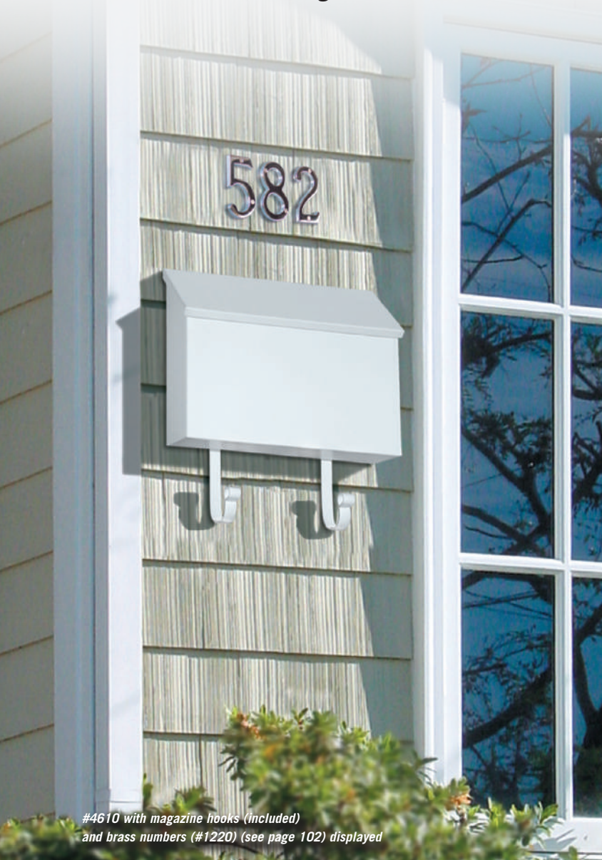
#4610 with magazine hooks (included) and brass numbers (#1220) (see page 102) displayed

Volume Discount Pricing Available On-Line!